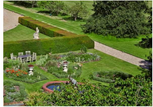
THE GROUNDS OF DORNEY