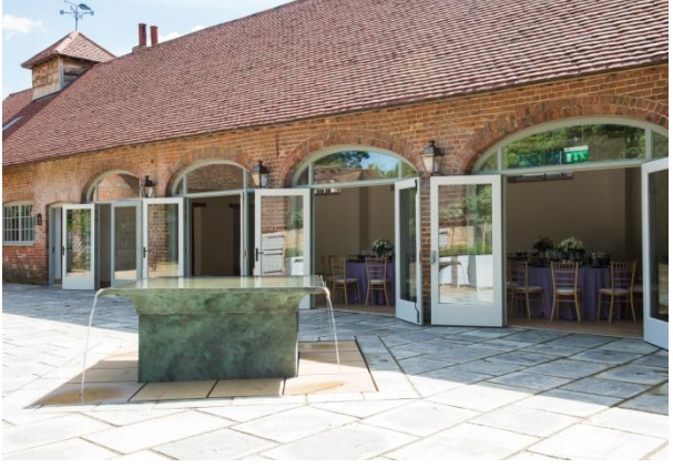
COACH HOUSE BARN & COURTYARD